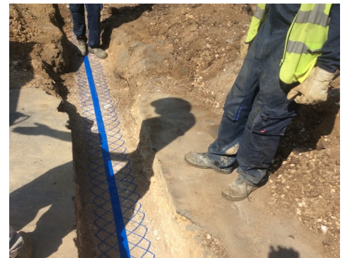
Safety strip laid across buried conduits